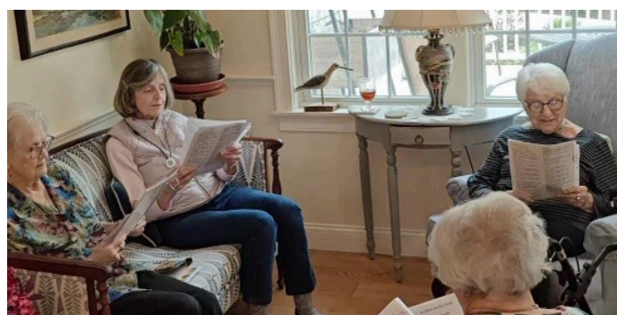
Residents playing a game below.