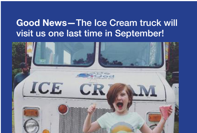
Good News—The Ice Cream truck will visit us one last time in September!